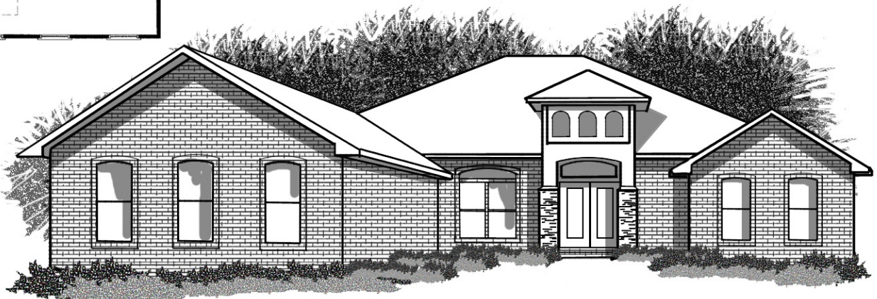
Traditional Brick Elevation

Features shown may vary from available options. Elevations and floorplan specifications are subject to change without notice or prior obligation. Dimensions are approximate. Plans copyright Westerheim Properties 2012. LS 04/2012